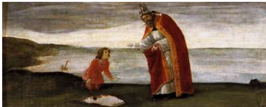
Sandro Botticelli's Vision of Saint Augustine, c.1488, Galleria degli Uffizi, Florence.

We have now resumed Ordinary Time in the Church's Calendar. Today we contemplate and celebrate the Most Holy Trinity , the mystery of God: Father, Son and Holy Spirit.